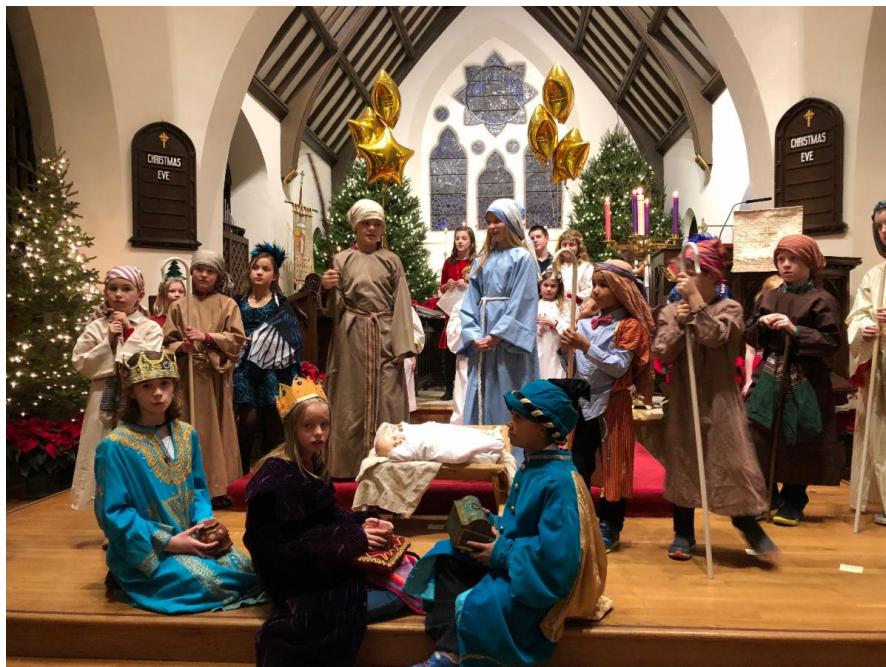
Nativity Pageant Tableau on Christmas Eve.